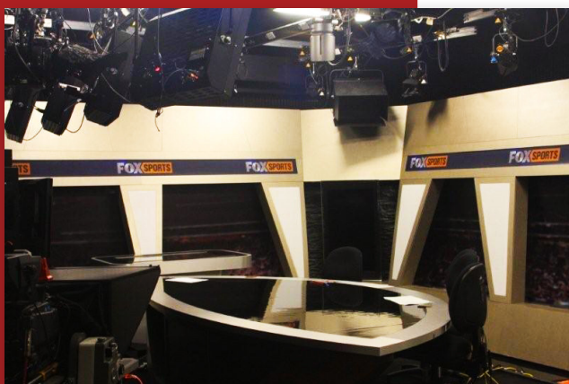
Fox Sports Sydney, NSW