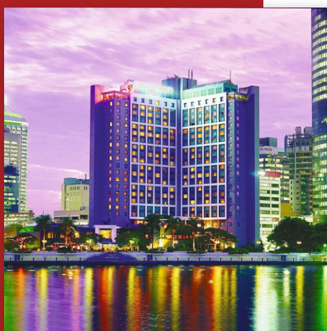
Stamford Plaza Hotel Brisbane, QLD

Rectification works to flood damaged basement (food prep, laundry, loading etc)