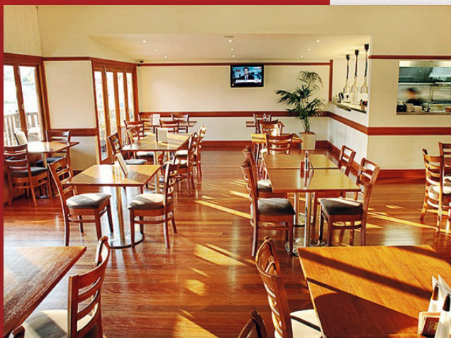
Maleny Hotel Maleny, QLD