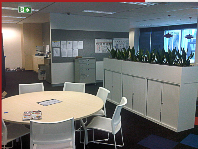
NetApp Brisbane, QLD