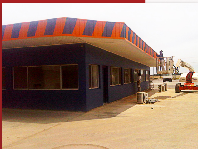
IS Australia Parra Hills West, SA