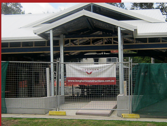
Canungra Hotel Canungra, QLD

Installation of all new internal linings, block work, plasterboard & tile ceilings, doors, jams & hardware